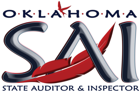
FY2019 Annual Report